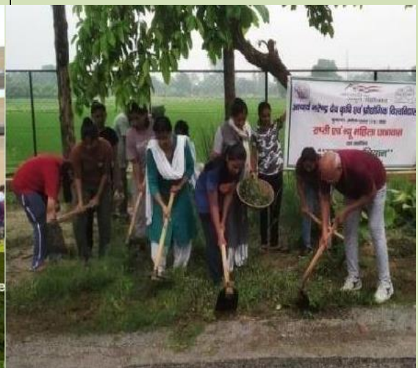
Cleanliness drive at Hostel premises on 4 th October, 2022 by faculty and students