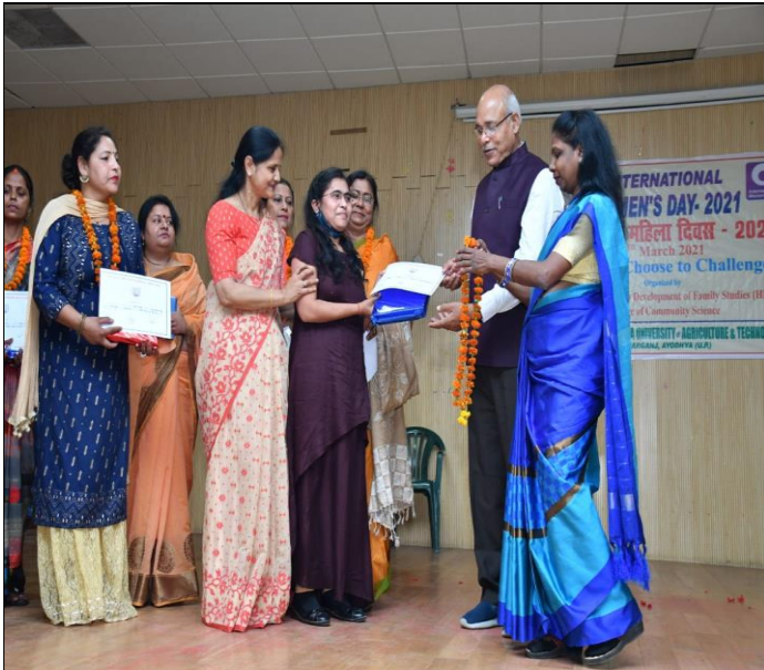
Two Day's Handicraft Training Programme For Women Empowerment from 5-6 March, 2021 held at Community Science