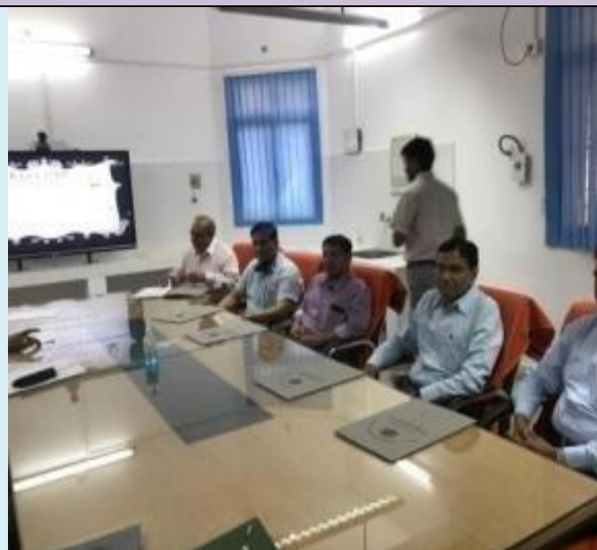
Institutional Animal Ethical Committee Meeting held on March 15 th 2022 in Veterinary Science and Animal Husbandry Unit