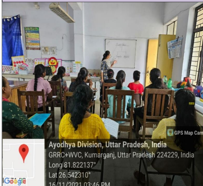
Classroom Lecture on “Practice of Human Ethics in Academic Unit” for undergraduate students (16-11-2021)