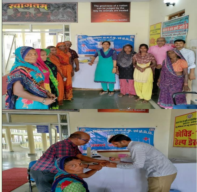
Blood Checkup Champ for farm women organized by Campus Hospital, ANDUA&T on 7 August, 2022