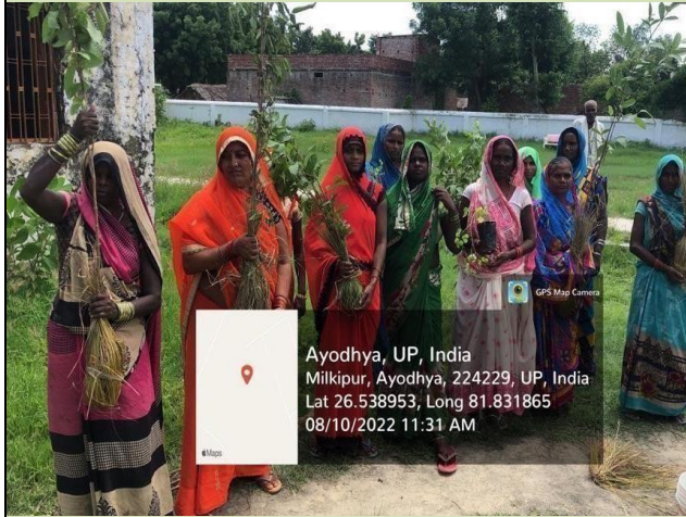
Distribution of saplings to women on 8 October, 2022 at Milkipur, Ayodhya