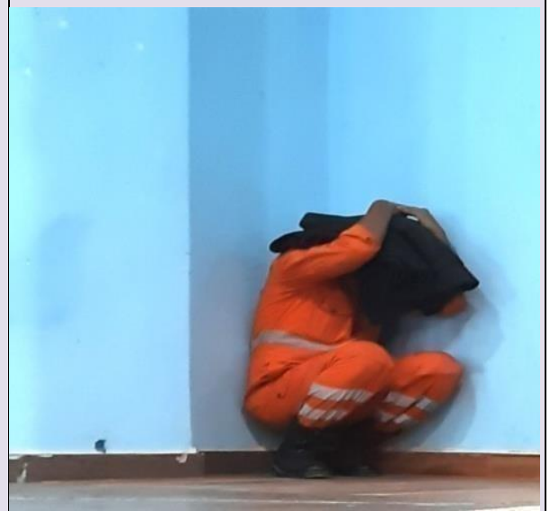
A mock drill session to look for whitespace during earth quake by NDRF Expert on 4 th November, 2019