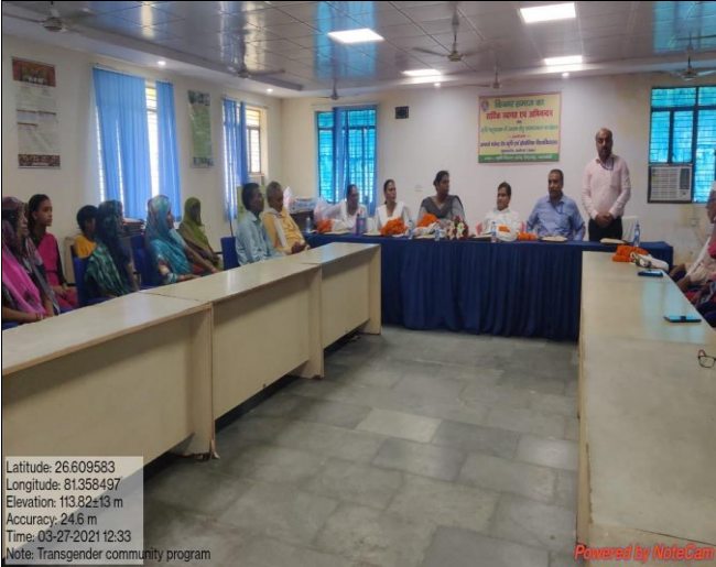
Panel Discussion on the social and legal right of Transgender Community on 27 March, 2021.