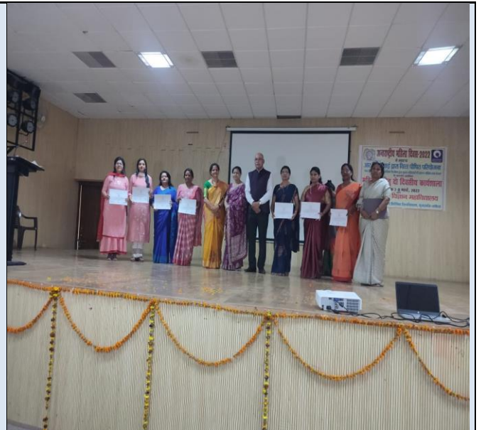
Two-day workshop organized on International Women's Day from 7-8 March, 2022 held at Community Science