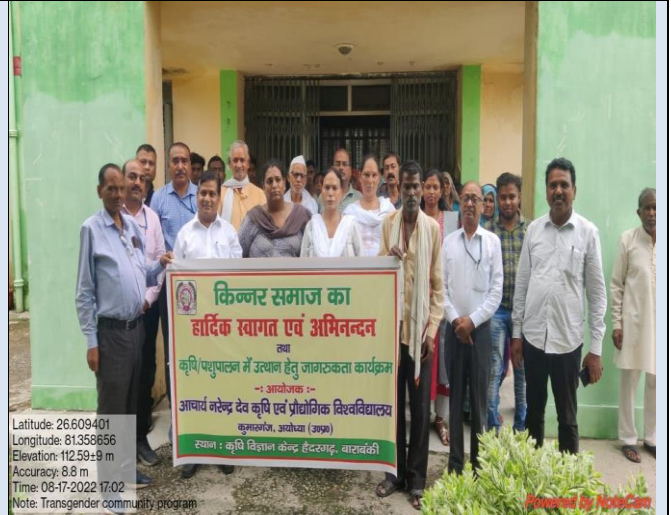
Awareness programme on “Educational Challenges for Transgenders” on 17 August, 2022.