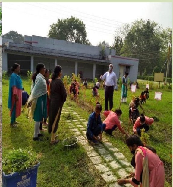
Plantation drive by students under NSS on 10 th August, 2022 in the Boys Hostel Premises