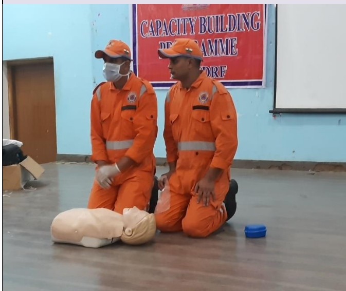
Demonstration of CPR done by NDRF Expert on 4 th November, 2019