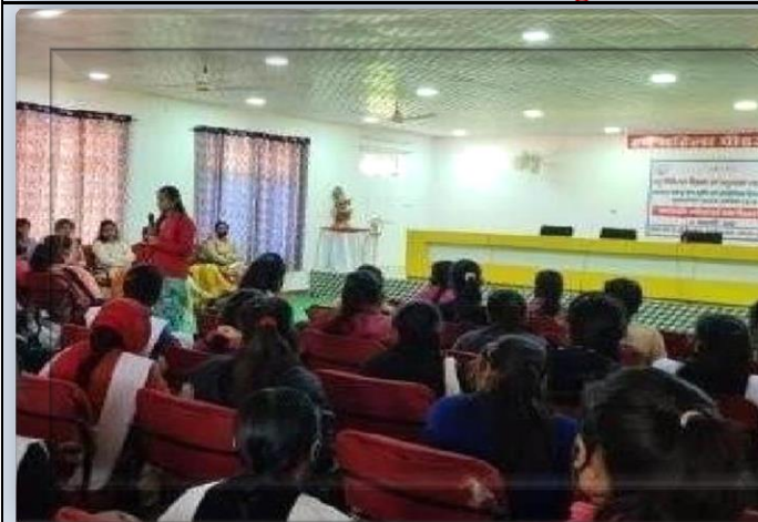
Sanitization Programme for rural girls on “Contribution of Indian Women in Science” on the occasion of International Day for Women and Girls in Science (11 th February, 2022)