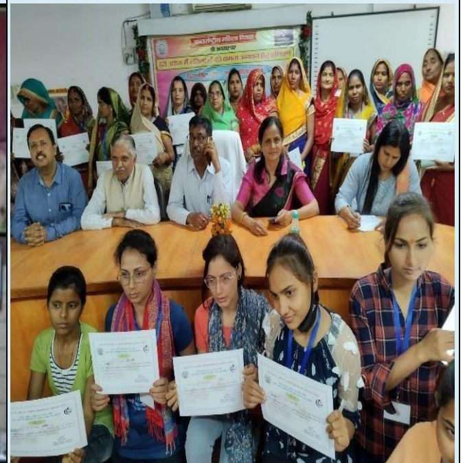
Capacity Building training of Rural Women in Dairy Farming from 1-4 March, 2023