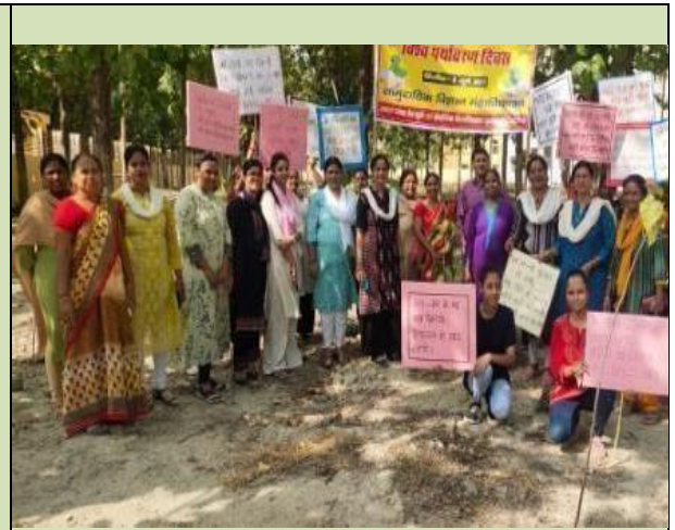
Plantation drive at Community Science premises on 5 th June 2022