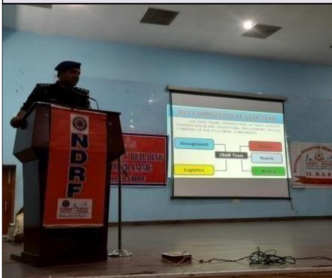
Captain Vinit Kumar briefing about activities and functioning of NDRF on 4 th November, 2019 at Veterinary Auditorium