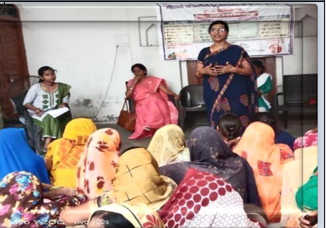
Awareness Programme for Women Education from 23-29 th September, 2022