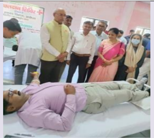
Blood Donation Camp organized on foundation day of Veterinary Science in which 35 students and 4 staff members donated blood (26 th March2022)