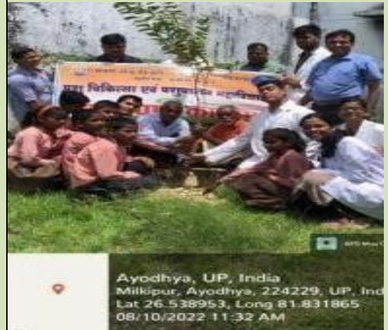
Promoting students to plant trees on 10 October, 2022