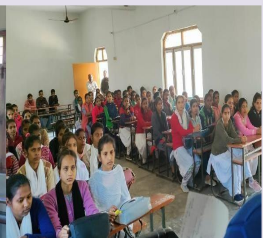
Awareness Programme on energy conservation held at Ram Navaz Degree College Bava, Kumarganj on 14 th Dec 2022 to mark Nation Energy Conservation day